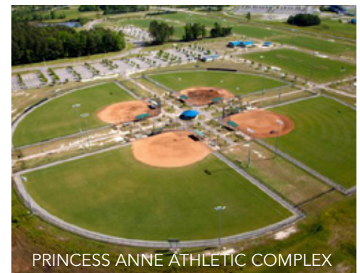
PRINCESS ANNE ATHLETIC COMPLEX